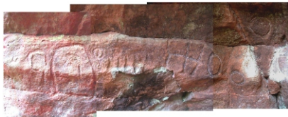
File: GlenSunPoint02.cdr/pdf (western wall) Nicola Moss, '05