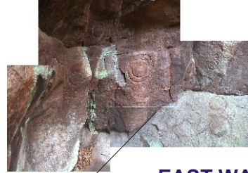
File: GlenSunPoint01.cdr/pdf (end wall) Nicola Moss, 05