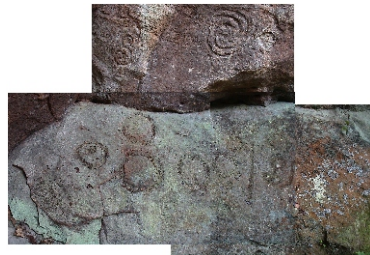
File: GlenSunPole07.cdr/pdf (eastern wall) Nicola Moss, '05