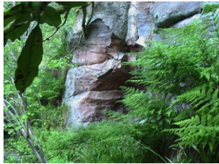
File: GlenSunPoint03.cdr/pdf (View of the Western Wall) Nicola Moss, '05