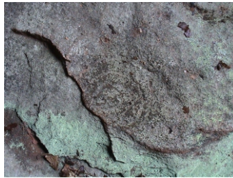
File: GlenSunPole06.cdr/pdf (Faint spiral from north end of the east wall) Nicola Moss, '05