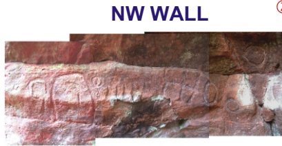
File: GlenSunPoint02.cdr/pdf (western wall) Nicola Moss, '05