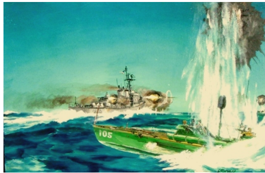
USS MADDOX (DD-731) TONKIN GULF INCIDENT, 2 AUG 1964 (IN INTERNATIONAL WATERS. ATTACKED BY 3 DRV PT BOATS.) PAINTED BY WILLIAM BUEHLER, 1965, OPS OFFICER IN MADDOX.