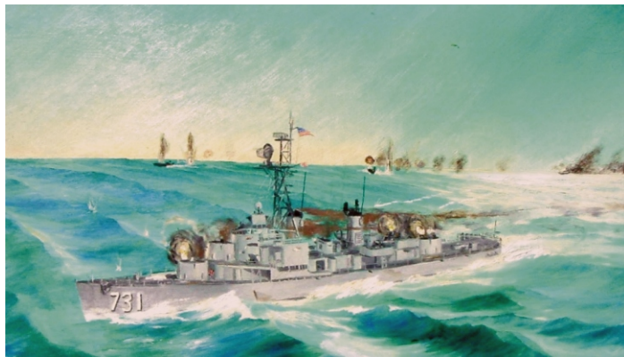
SURFACE ACTION STARBOARD! USS MADDOX (DD-731) TONKIN GULF INCIDENT, 2 AUG 1964 (IN INTERNATIONAL WATERS. ATTACKED BY 3 DRV PT BOATS.) PAINTED BY WILLIAM BUEHLER, 1965, OPS OFFICER IN MADDOX.