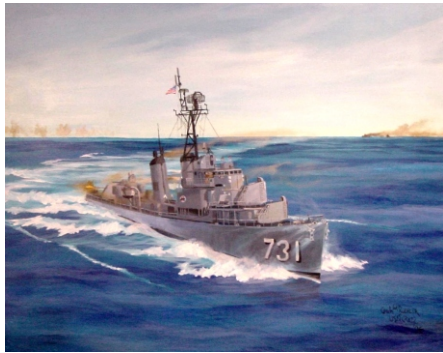
MADDOX EVADES TORPEDOS USS MADDOX (DD-731) TONKIN GULF INCIDENT, 2 AUG 1964 (IN INTERNATIONAL WATERS. ATTACKED BY 3 DRV PT BOATS.) PAINTED BY WILLIAM BUEHLER, 1965, OPS OFFICER IN MADDOX.