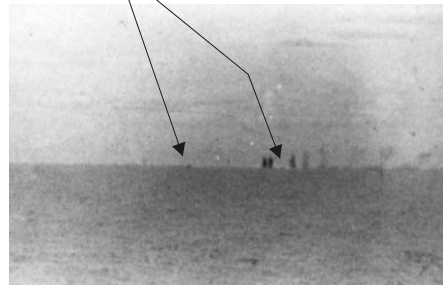
(FROM US NAVY OFFICIAL PHOTOGRAPH)