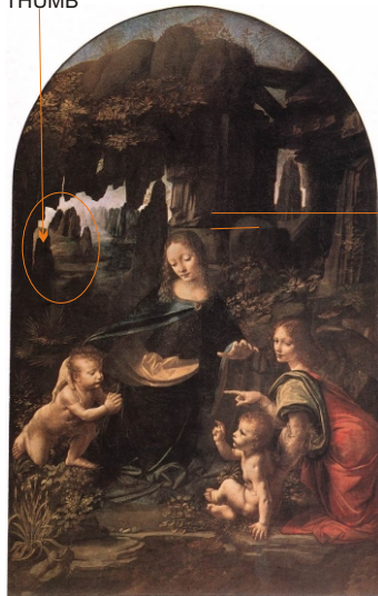
"VIRGIN OF THE ROCKS" by Leonardo da Vinci